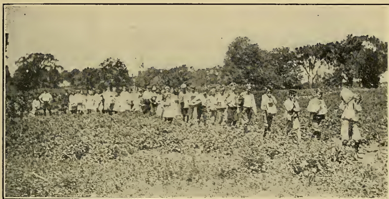
AFTER A PICKING. M. A. C. SCHOOL GARDEN

21. Beekeeping. A course designed particularly for school teachers or beginners in the subject. It comprises the elementary and practical features of the beekeeping industry, including equipment, handling and manipulation of bees, essential apparatus; also a discussion of the diseases and names of the honey bee; the utilization of bees as nature study material in the lecture and school room, as well as for pleasure. Five lectures and such laboratory periods as can be arranged each week second two weeks.